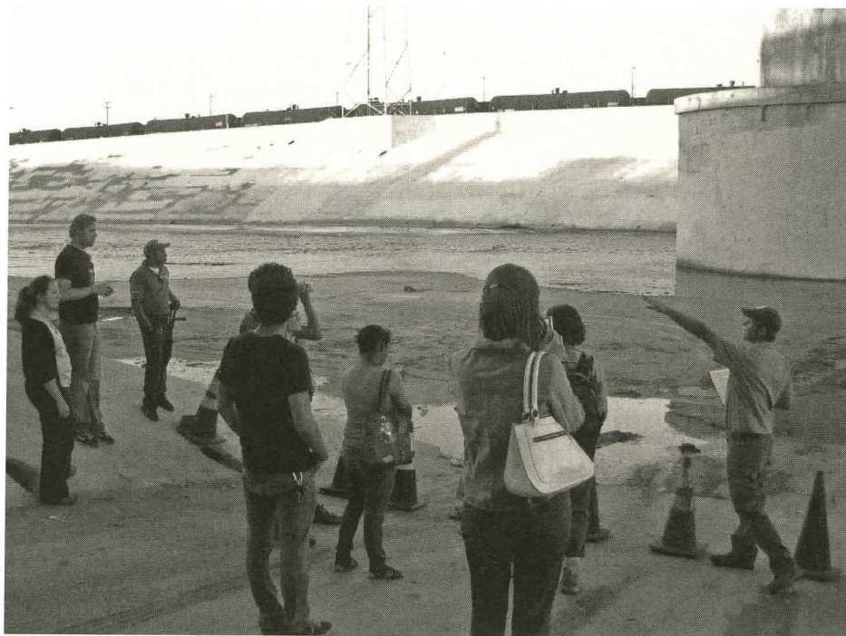
9. Los Angeles Urban Rangers, "L.A. River Ramble," August 4, 2011. Program from the series Public Access 101: Downtown L.A. for "Engagement Party" at the Museum of Contemporary Art, Los Angeles.

object and art viewer is collapsed. By depending on the participation of the audience to activate the experience, artists' tours can be seen as part of the "social turn" in contemporary art, in which the terms of spectatorship and meaning-making are renegotiated to accommodate some degree of improvisation and collaboration with the viewers. 3